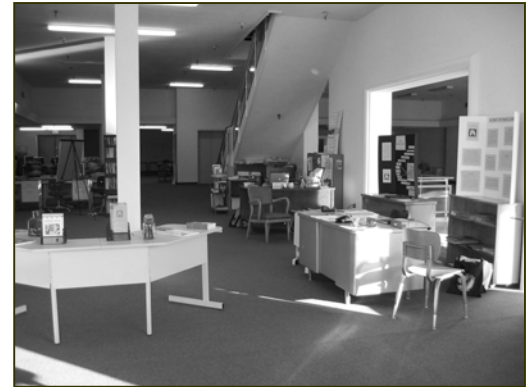
Interior photos of 48 E. Pennington St.: current office space on main floor (top); future classroom space on second floor (bottom).

Join City High School and Voices, Inc. for an evening of food, drink, and entertainment.